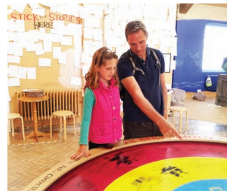
The Story Museum