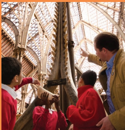
Oxford University Museum of Natural History