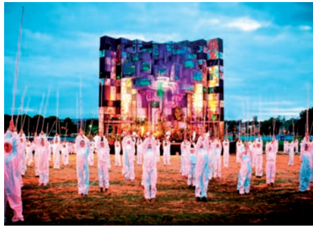
Tree of Light