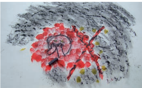
Thames Valley Partnership