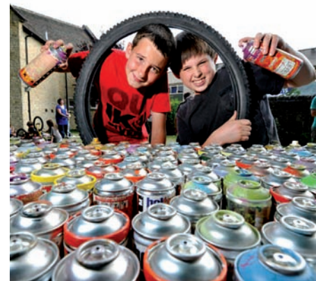
Pimp My Bike an OYAP Trust project with children aged 12 to 17

Youth Arts Development & Brokerage page 19