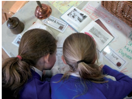
River & Rowing Museum